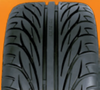
KAISER KR 20